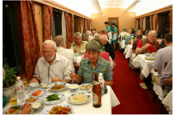
Chinese Restaurant Car (Example)