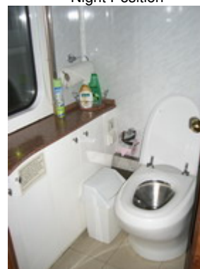
Lavatory & Toilet