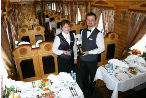
Russian Restaurant Car (Example)

There are 2 restaurant cars on the train that serve breakfast, lunch and dinner as part of the full board service to all passengers of the Grand Trans Siberian Express. Local cuisine will be part of the menu: Russian cuisine in Russia and Mongolia, Chinese cuisine in China.